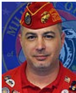
Worthy Barking Dog DD Lewis Rice